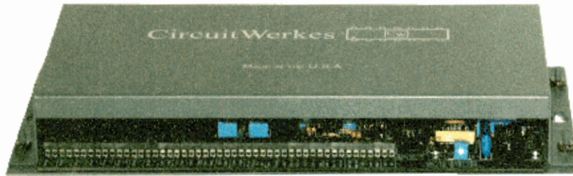
Shown without Included Rack Mount

The new CircuitWerkes DR-10 Dial-up remote control is perfect for studio & automation control. With features not found anywhere else, you might be amazed at the DR-10's list price of only $399.00.